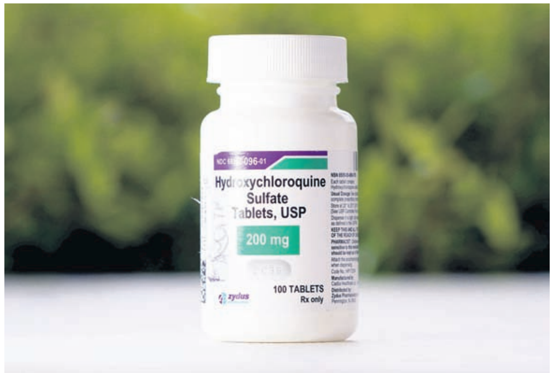
This April 7, 2020 file photo shows a bottle of hydroxychloroquine tablets in Texas City, Texas.